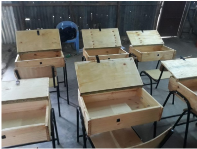
Left: New desks, chairs and lockers purchased.

The most urgent task is to get the upper floor of the Parry Building fitted out as classrooms. Our aim is to get two classrooms operating this school year and three more ready for next year. In the Spring, our newly formed Media Team will be launching a campaign to fund this project .