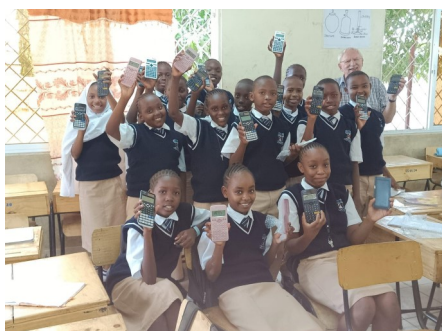
The new Grade 7 class.

A late change in the directive from the government allowed the Lower Secondary School to be housed in the same premises as the Primary School. Three Trustees, visiting Unity School in March, discovered that too much work was required on the rooms hired to comply with the original government requirements, to make them fit for purpose. A conversation was initiated with the contractor who built the Parry Building to discuss what could be done to provide more rooms using the top floor of the Parry Building. A few days later he came back to us with an offer to build five rooms (as per the original plans for the building). The charity would pay for three rooms at £8000 each and his colleague would finance the other two. This was an offer too good to refuse—the only problem, we did not have £24,000. After a few phone calls, we had offers of interest free loans and an agreement to stagger the payments, that would enable work to commence. Work began almost immediately, as did the fundraising. A further offer to fund a classroom from Natural Tours and Safaris has moved us closer to paying the bill.